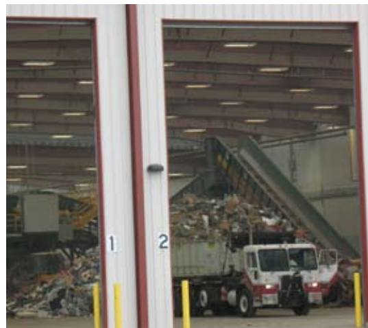
Waste Management C&D MRF.