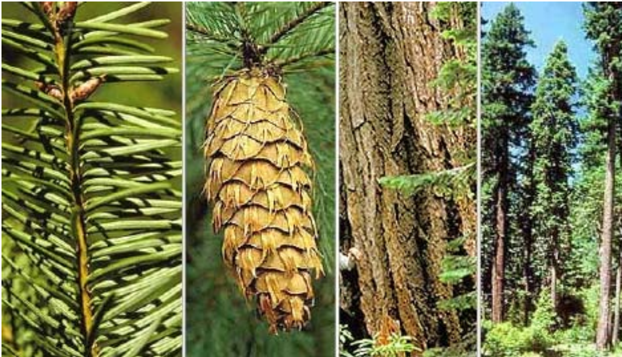
More sustainable paper practices will help conserve our forests, streams and local jobs.