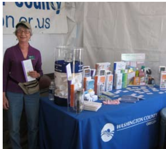
Staff a booth at Washington County Public works event

Come share the principals of the "Three Rs" at this well-attended public works agency event. Materials and displays will be set-up prior to the Saturday start time, but the final shift on Sunday will pack away materials for transportation to the County offices.