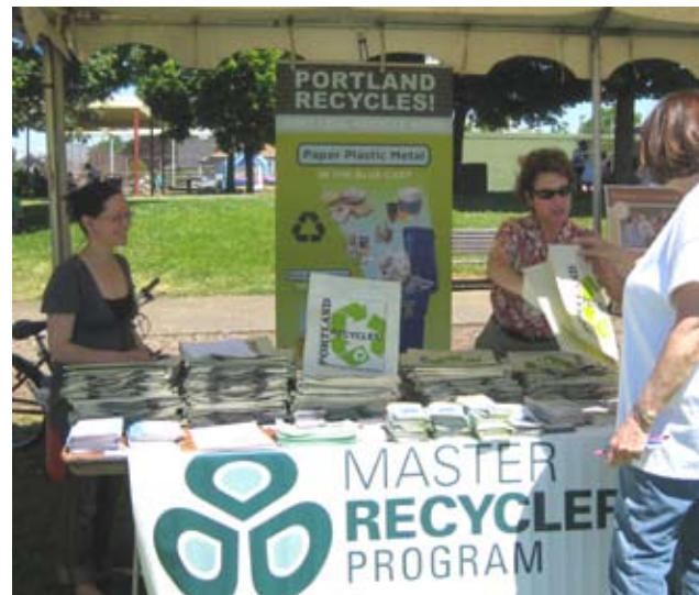
Staff a booth at St. Johns Bizarre.

Saturday, May 9th 9:30 a.m. – 2 p.m. and 2 p.m. – 6:30 P.m.