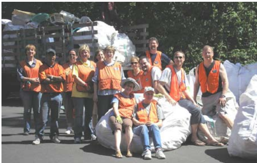
Lake Oswego crew celebrates recycling 5 tons of plastic at their site.