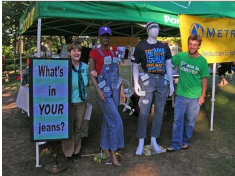
What's In Your Jeans? at Cracked Pot Art Show.