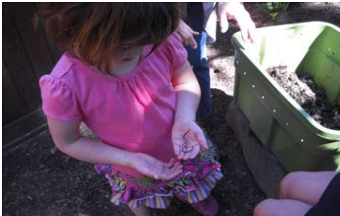
Worms at the Backyard Makeover table at the Zoo.

Washington County Fair Complex, 873 NE 34th Ave, Hillsboro Thursday, July 28th to Sunday, July 31st Shifts: 10 a.m – 2 p.m., 2 – 4:30 p.m., 4:30 – 8 p.m.