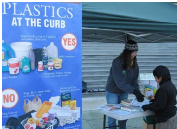
Hillsboro Farmers Market will be a lot warmer in July!

Table on recycling and Greener Cleaner (and worms later in the season). Times include set up and breakdown.