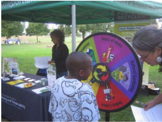
Play the Wheel of Fortune with Metro Staff.

THRD Recreation Complex, SW 158th & Walker Roads, Beaverton Saturday July 30th 11 a.m. – 7 p.m.