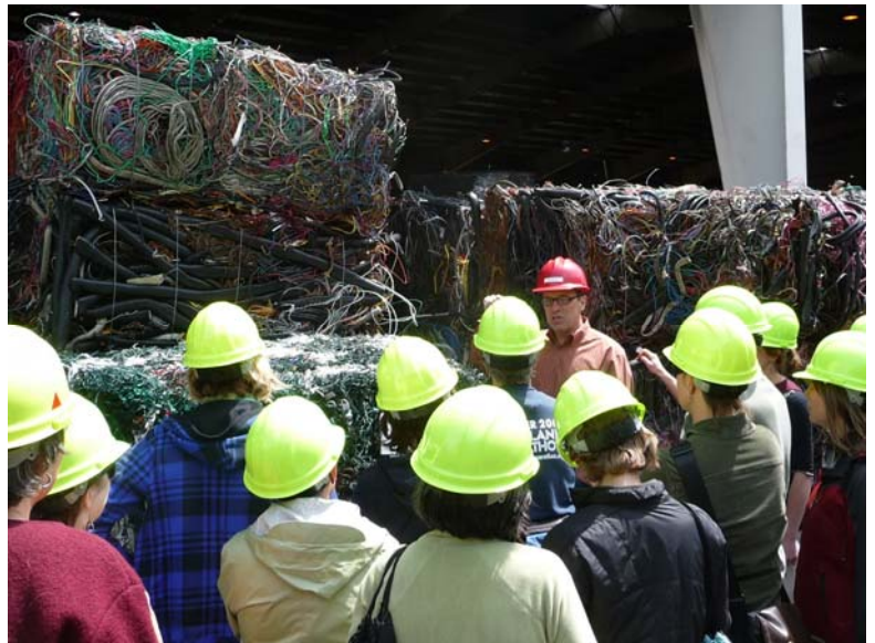
Master Recyclers at Metro Metals.