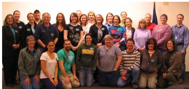
Class 40 Clackamas County