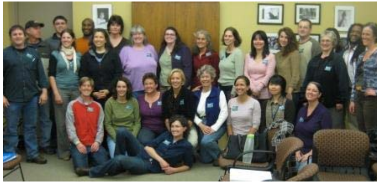
Class 41 Portland Class.